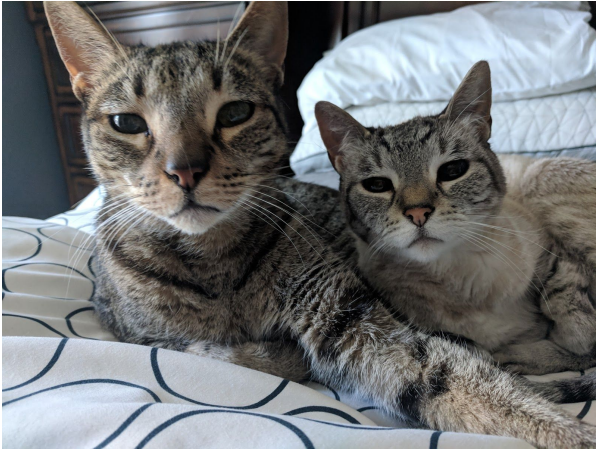
Lexi (white/grey) Lynx (brown/black)